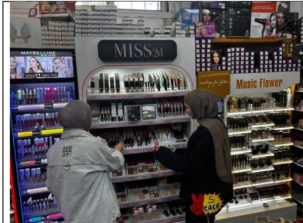
Training of Integrated programs' Students in local market