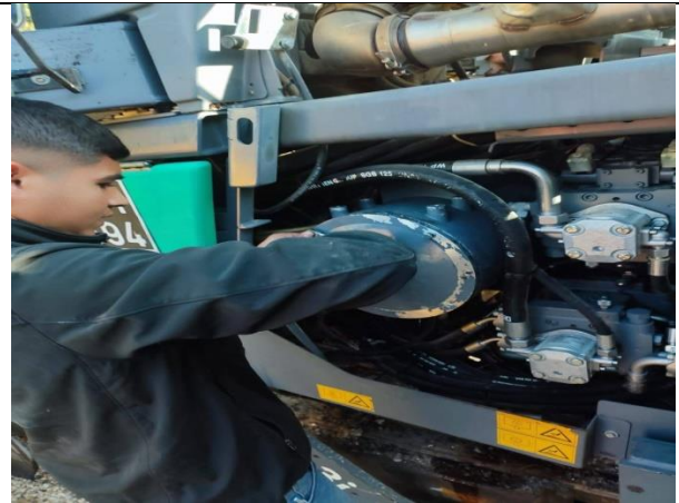
Training of Integrated programs' Students in local market