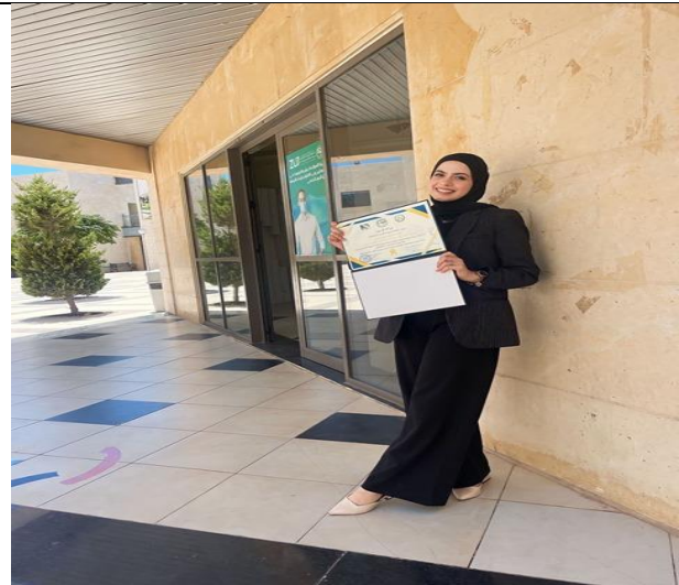
Students Exchange Program- Arab and International Universities