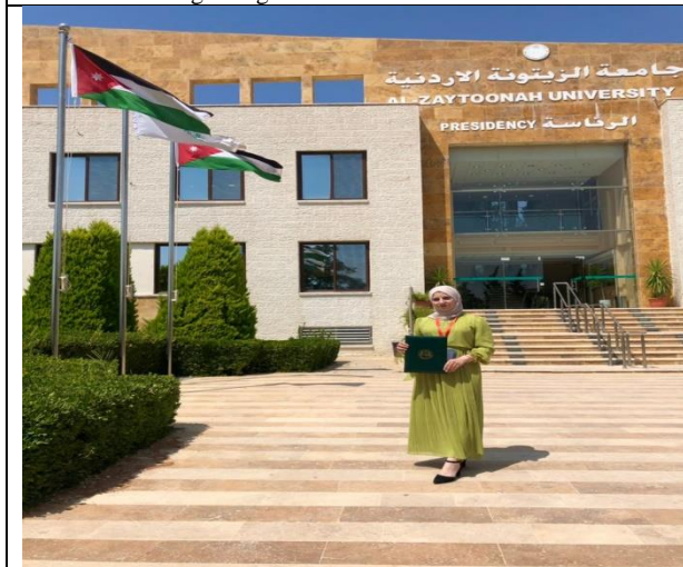
Students Exchange Program- Arab and International Universities