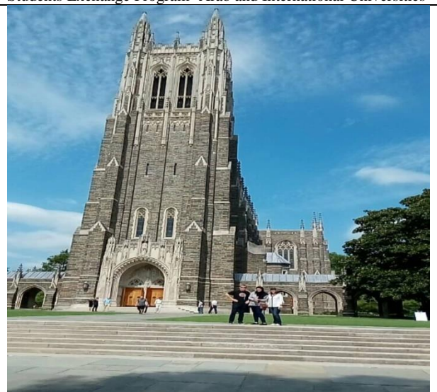
Students Exchange Program- Arab and International Universities