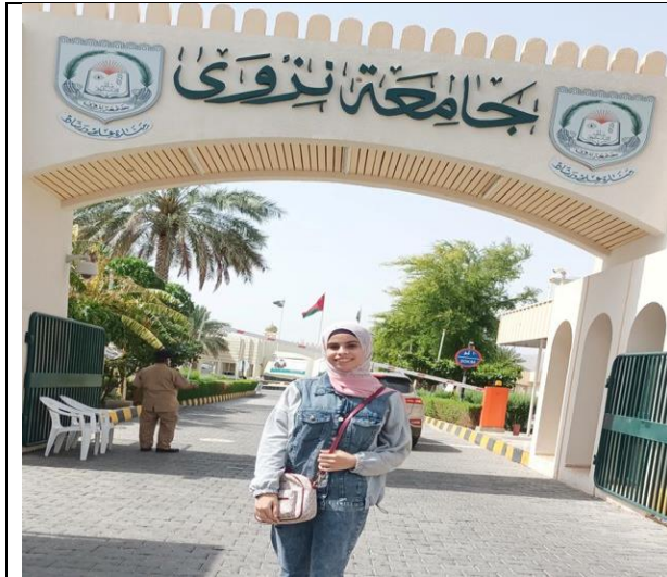
Students Exchange Program- Arab and International Universities