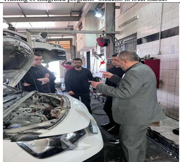
Training of Integrated programs' Students in local market