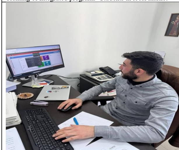
Training of Integrated programs' Students in local market