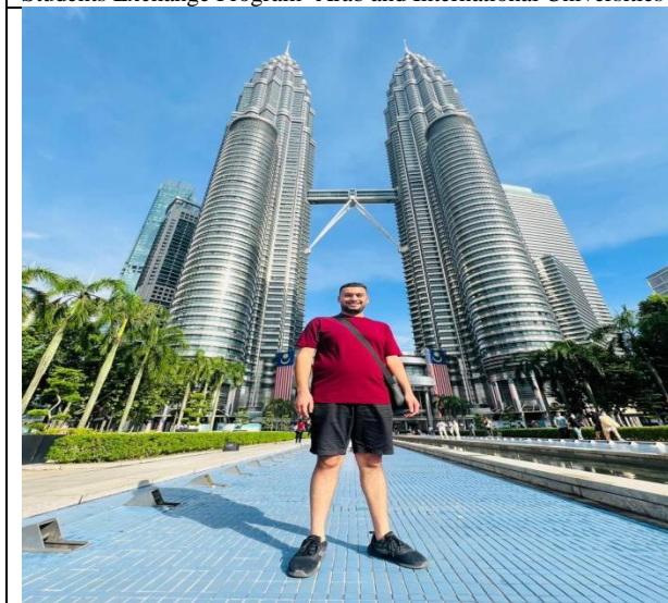
Students Exchange Program- Arab and International Universities