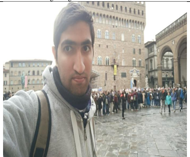
Students Exchange Program- Arab and International Universities